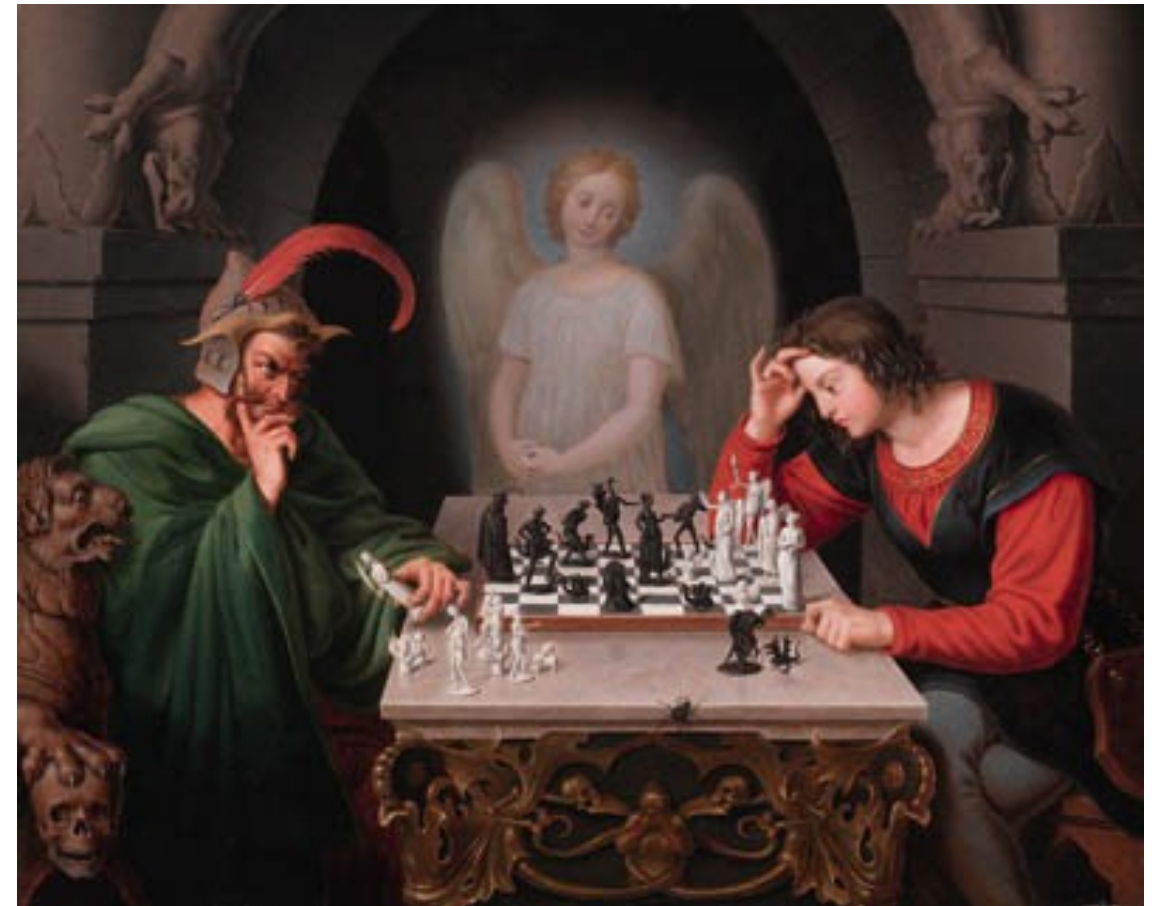
Moritz Retzsch, "The Chess Players"