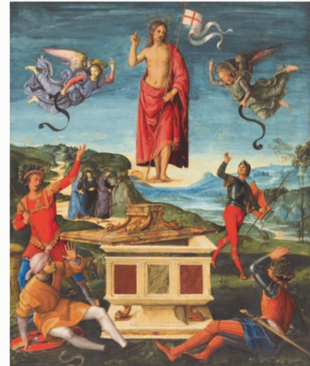
Resurrection of Jesus Christ by Raphael

Feast of the Resurrection - Easter Day April 20, 2025 • 9 AM & 11 AM