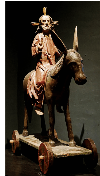
A wooden Palmesel (figure of Christ on a donkey, mounted on a wheeled platform) from Southern Germany

(631) 283-0549 or secretary@stjohnsouthampton.org