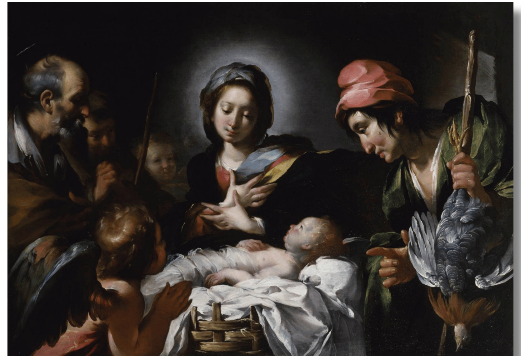
Adoration of the Shepherds by Bernardo Strozzi

Fourth Sunday of Advent December 22, 2024 • Holy Eucharist, Rite II • 9 AM