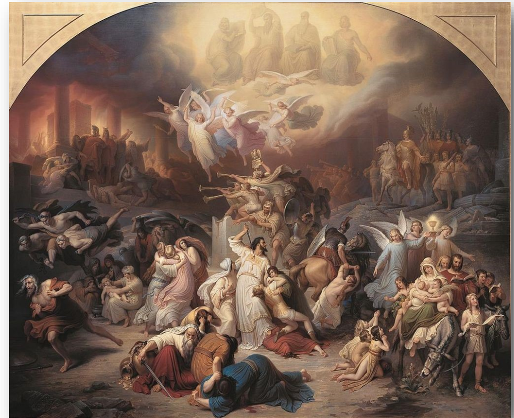
Titus Destroying Jerusalem by Wilhelm von Kaulbach

secretary@stjohnsouthampton.org or (631) 283-0549