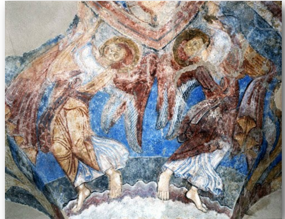
Ancient fresco of two angels in Canterbury Cathedral

100 South Main Street | P. O. Box 5068 Southampton, New York 11969-5068 (631) 283-0549