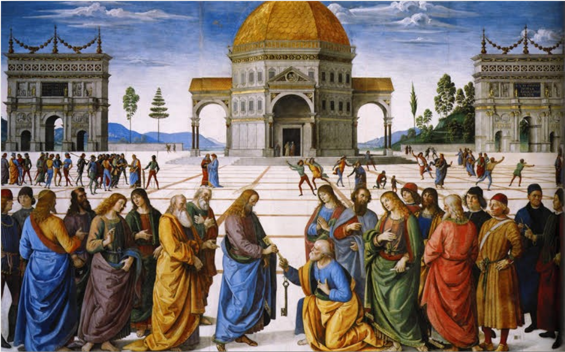
Christ Handing the Keys to St. Peter by Pietro Perugino