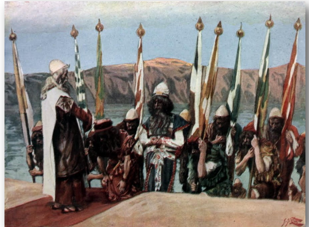
Moses Blesses Joshua Before the High Priest by James Tissot

100 South Main Street | P. O. Box 5068 Southampton, New York 11969-5068 (631) 283-0549