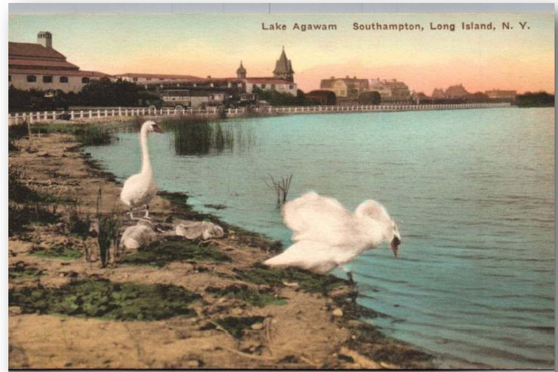
1929 July 4th Celebration, Lake Agawam Park, Southampton

St. Andrew's Dune Church 12 Gin Lane | Southampton, NY 11969