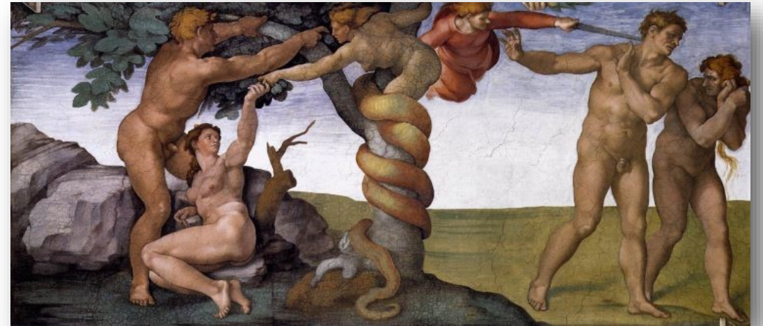
The Temptation and Expulsion from the Garden of Eden by Michelangelo on the ceiling of the Sistine Chapel

100 South Main Street | P. O. Box 5068 Southampton, New York 11969-5068 (631) 283-0549