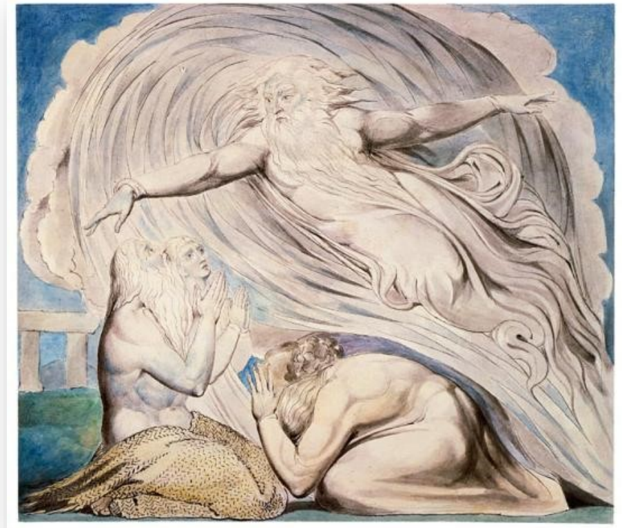
The Lord Answering Job Out of the Whirlwind by William Blake

Services are available online through Facebook Live: Facebook.com/StJohnSouthampton