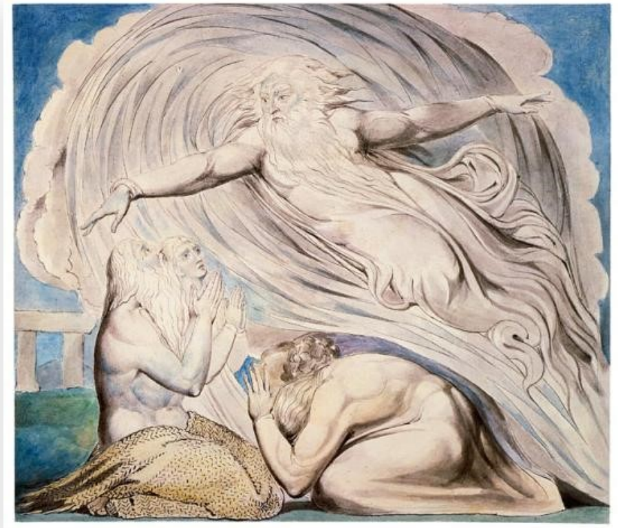
The Lord Answering Job Out of the Whirlwind by William Blake

100 South Main Street | P. O. Box 5068 Southampton, New York 11969-5068 (631) 283-0549