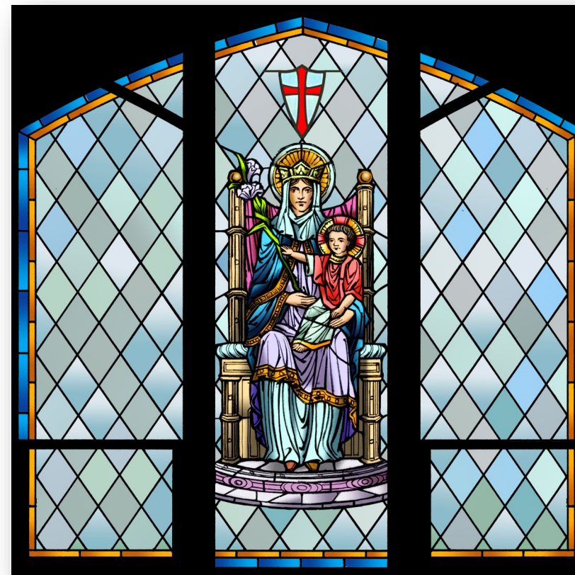
Our Lady of Walsingham. The Anglican Madonna and Child

Services are available online through Facebook Live: Facebook.com/StJohnSouthampton