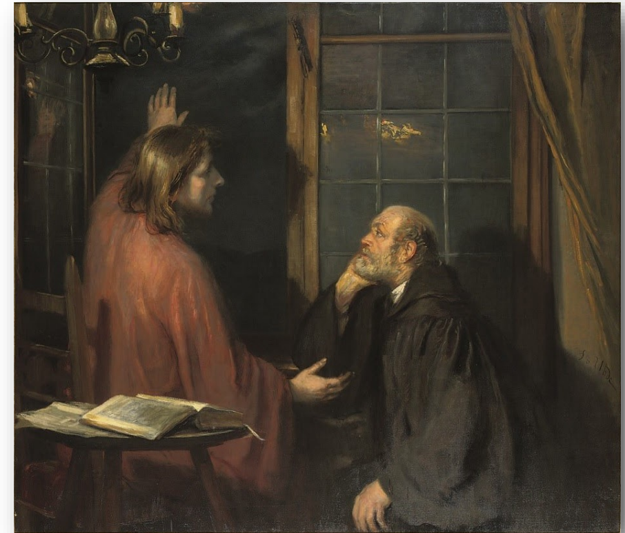
Christus und Nicodemus by Fritz von Uhde

Services are available online through Facebook Live: Facebook.com/StJohnSouthampton