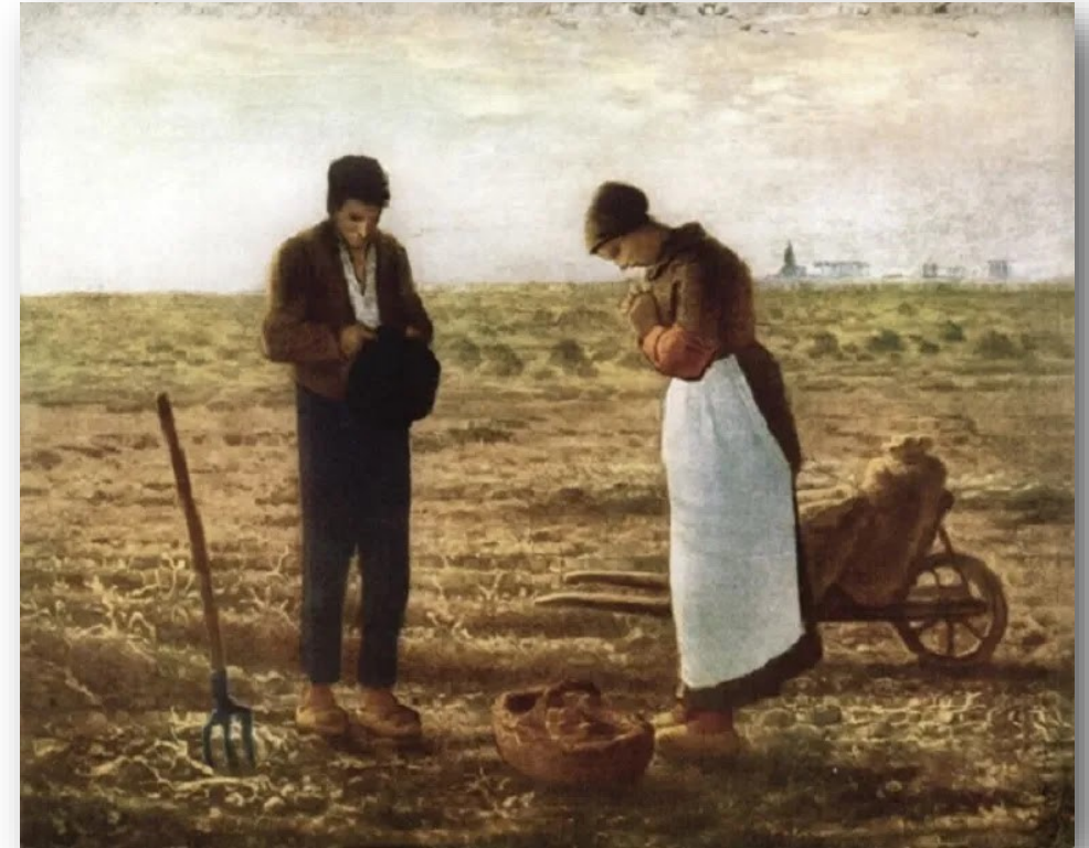
The Angelus by Jean-Francois Millet

100 South Main Street | P. O. Box 5068 Southampton, New York 11969-5068 (631) 283-0549