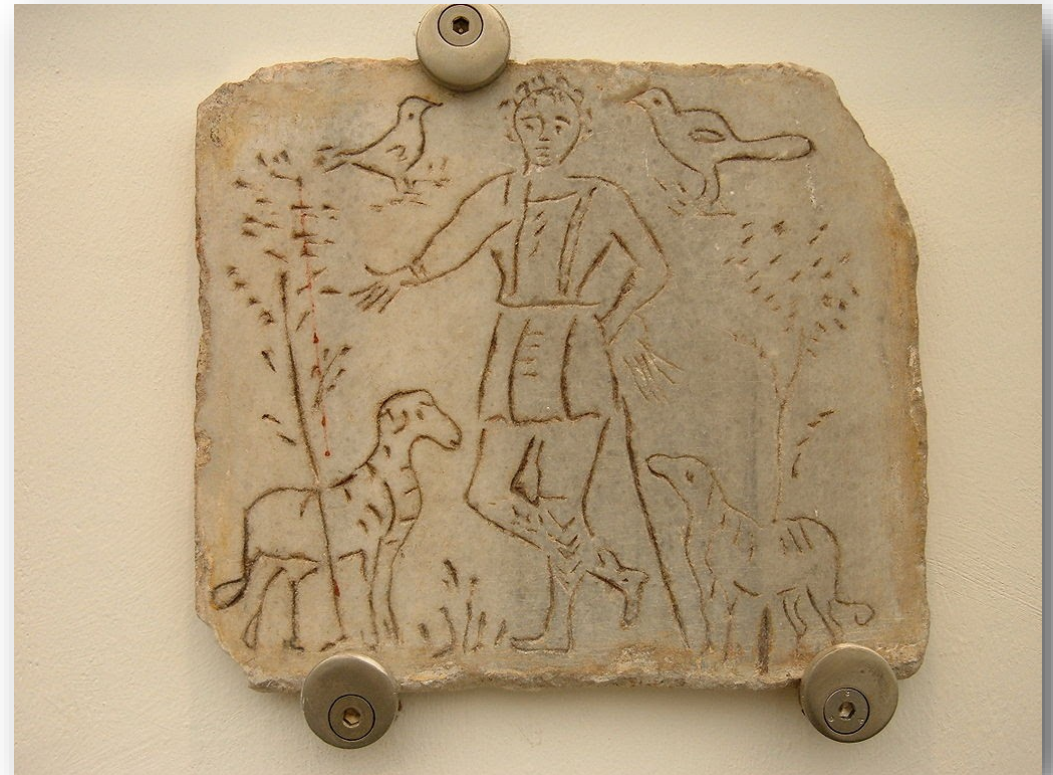
Christ, the Good Shepherd, a plaque taken from Museum of the Baths of Diocletian, Rome

St. John's Episcopal Church 100 South Main Street | P. O. Box 5068 Southampton, New York 11969-5068 (631) 283-0549