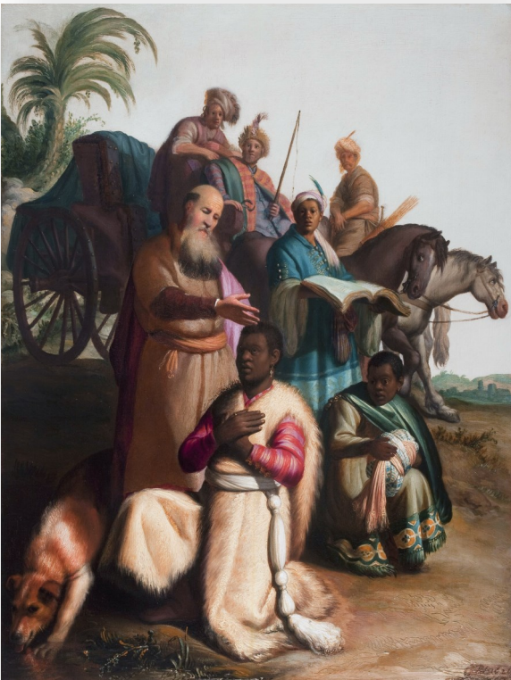
The Baptism of the Eunuch by Rembrandt

100 South Main Street | P. O. Box 5068 Southampton, New York 11969-5068 (631) 283-0549