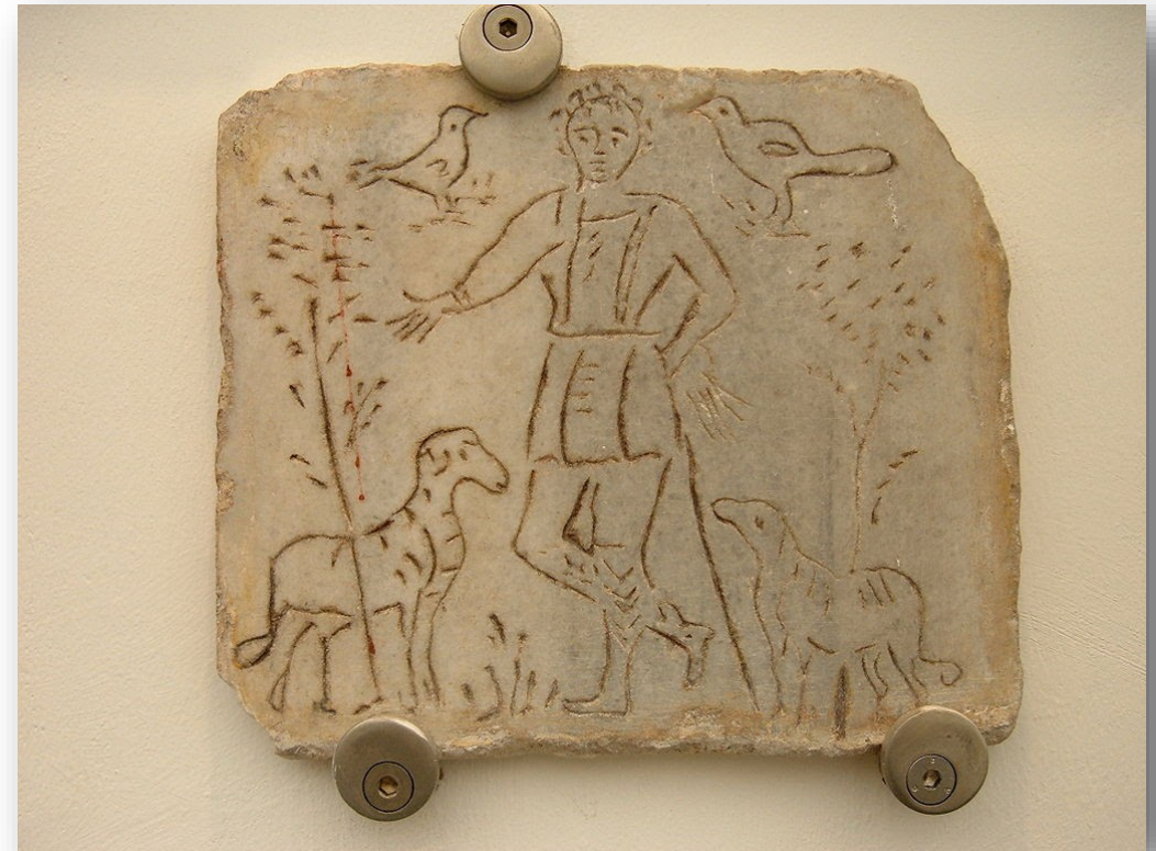
Christ, the Good Shepherd , a plaque taken from Museum of the Baths of Diocletian, Rome

100 South Main Street | P. O. Box 5068 Southampton, New York 11969-5068 (631) 283-0549