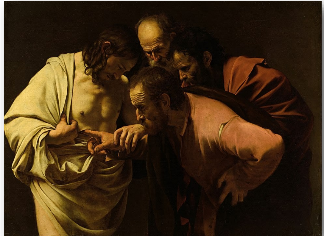
The Incredulity of Saint Thomas by Caravaggio

100 South Main Street | P. O. Box 5068 Southampton, New York 11969-5068