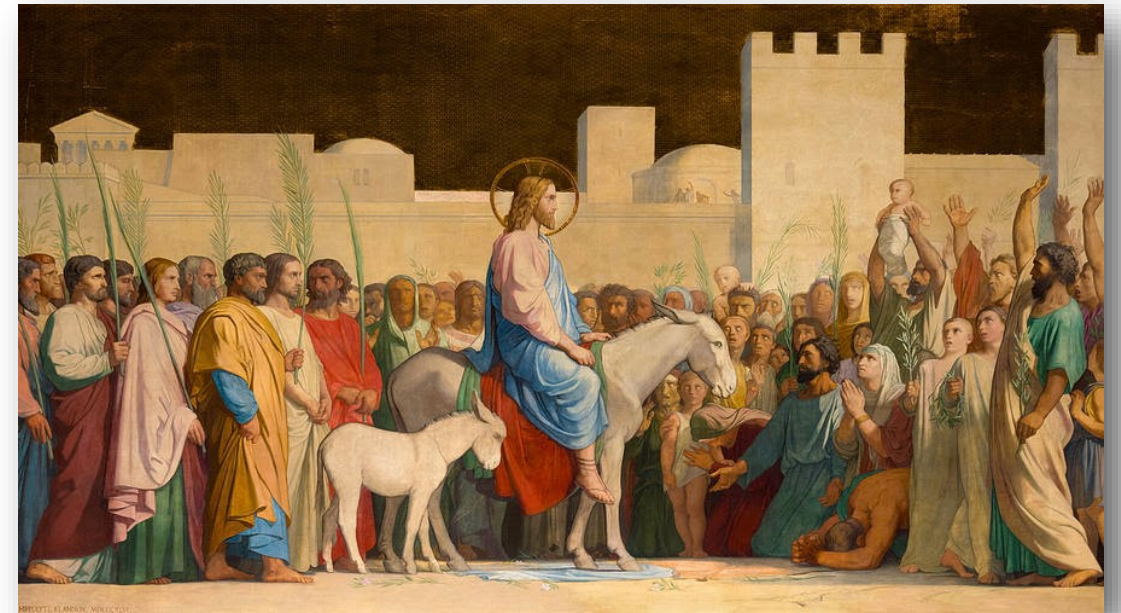
The Entrance of Christ into Jerusalem by Jean-Hippolyte Flandrin

Services are available online through Facebook Live: Facebook.com/StJohnSouthampton