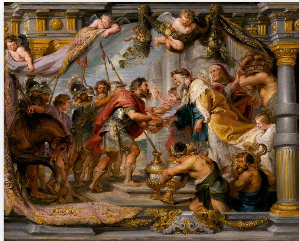
The Meeting of Abraham and Melchizedek by Sir Peter Paul Rubens

St. John's Episcopal Church 100 South Main Street | P. O. Box 5068 Southampton, New York 11969-5068 (631) 283-0549