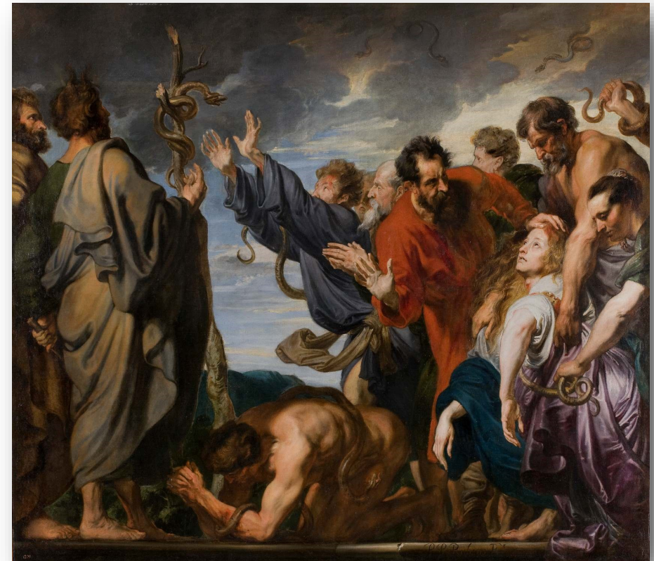
The Brazen Serpent by Anthony van Dyck

St. John's Episcopal Church 100 South Main Street | P. O. Box 5068 Southampton, New York 11969-5068 (631) 283-0549