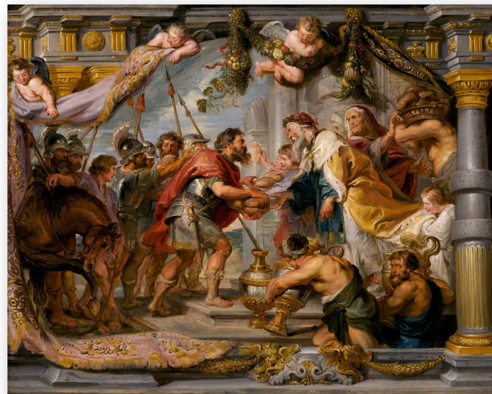
The Meeting of Abraham and Melchizedek by Sir Peter Paul Rubens

Services are available online through Facebook Live: Facebook.com/StJohnSouthampton