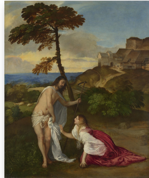
Christ and Mary Magdalene (Noli me tangere) by Titian

Services are available online through Facebook Live: Facebook.com/StJohnSouthampton