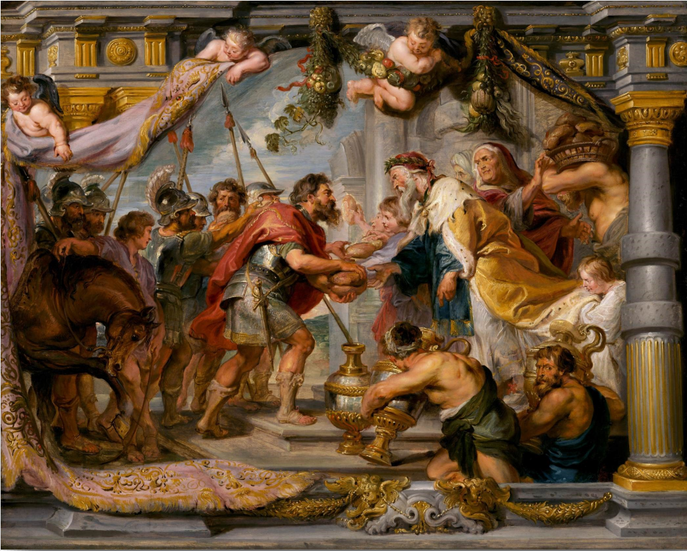
The Meeting of Abraham and Melchizedek by Sir Peter Paul Rubens

Services are available online through Facebook Live: Facebook.com/StJohnSouthampton