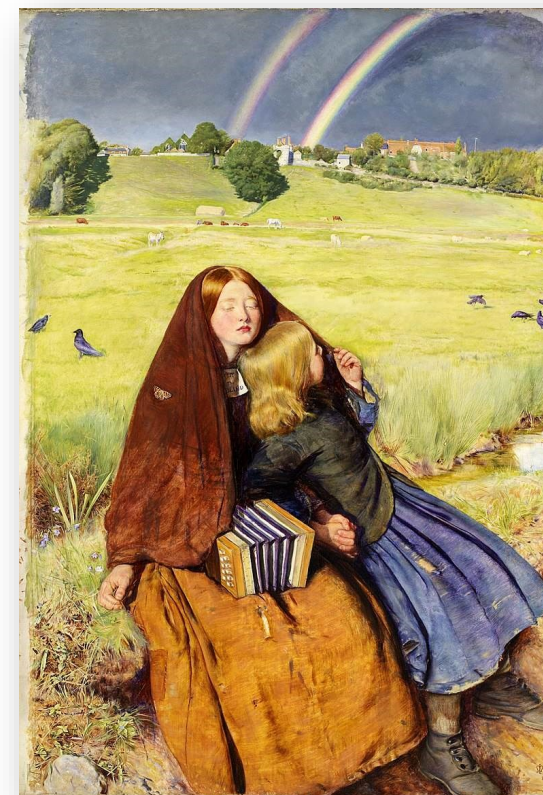
The Blind Girl by John Everett Millais

St. John's Episcopal Church 100 South Main Street | P. O. Box 5068 Southampton, New York 11969-5068 (631) 283-0549