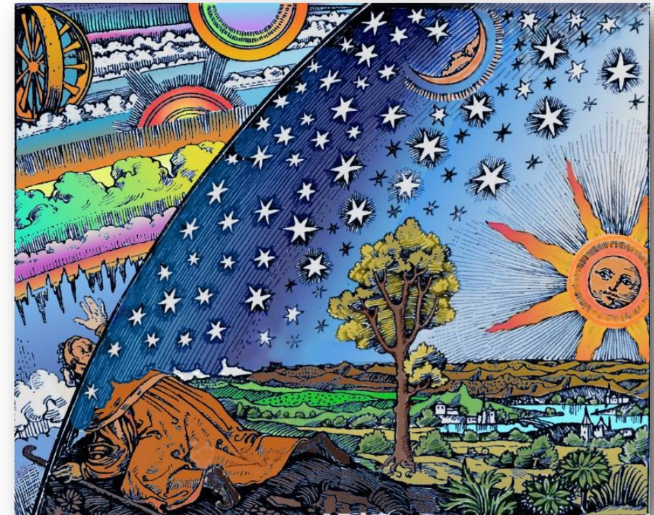
The Flammarion engraving, a wood engraving by an unknown artist that appeared in Camille Flammarion's L'atmosphère: météorologie populaire (1888)

Services are available online through Facebook Live: Facebook.com/StJohnSouthampton