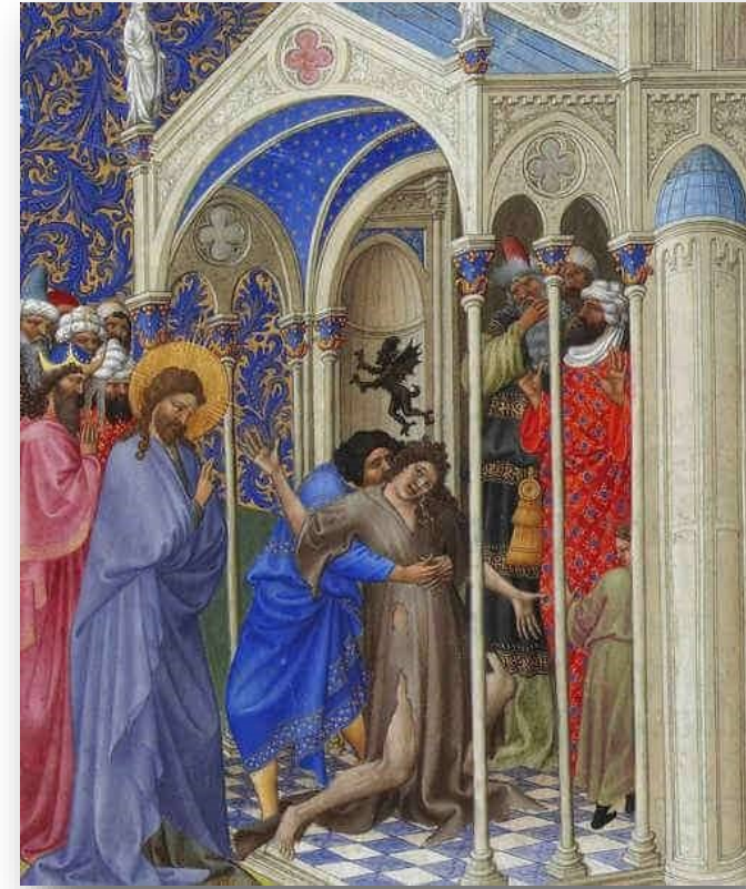
Jesus expels the Unclean Spirit from the 15th-century illuminated manuscript Très Riches Heures

100 South Main Street | P. O. Box 5068 Southampton, New York 11969-5068 (631) 283-0549