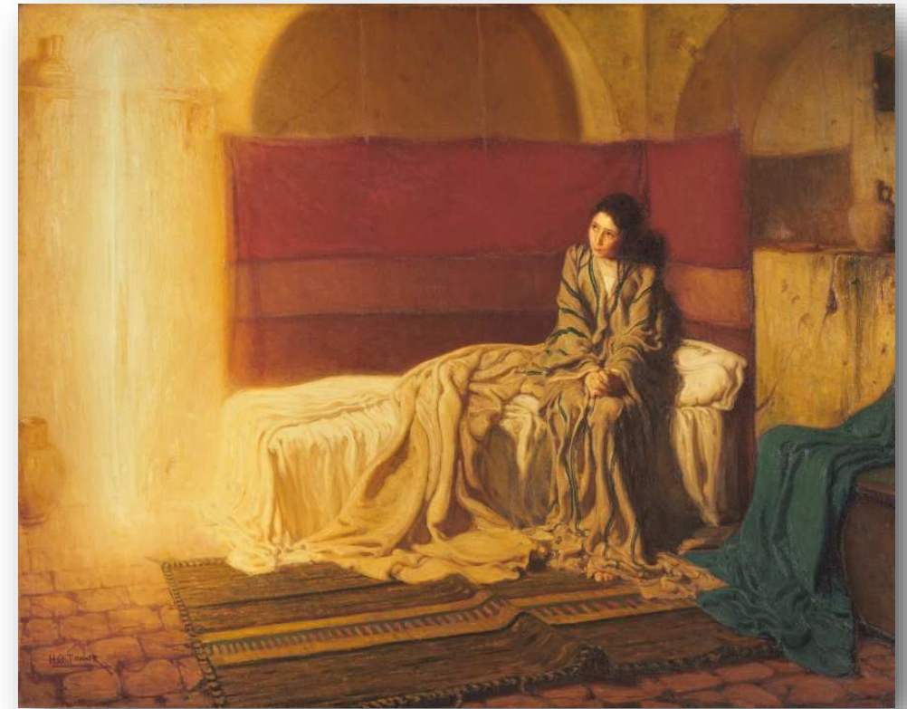
The Annunciation by Henry Ossawa Tanner

Services are available online through Facebook Live: Facebook.com/StJohnSouthampton