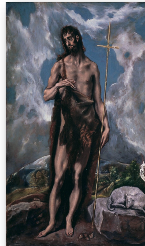
John the Baptist in the wilderness by El Greco

St. John's Episcopal Church 100 South Main Street | P. O. Box 5068 Southampton, New York 11969-5068 (631) 283-0549