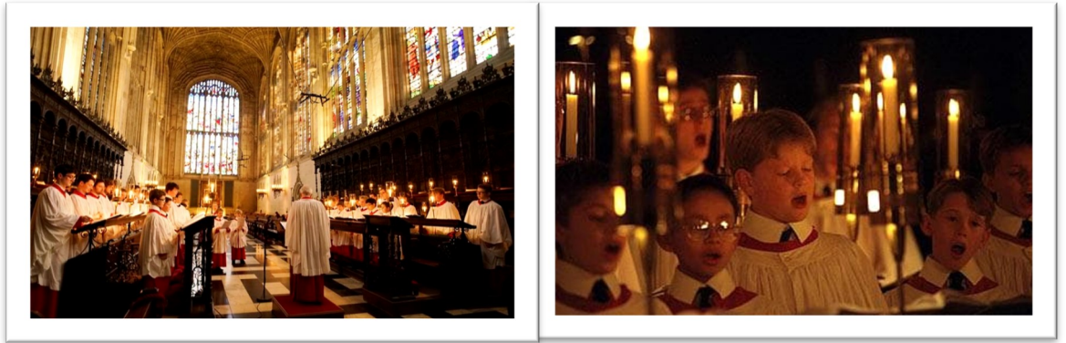
Images from King's College Chapel, Cambridge University in England where the Festival of Nine Lessons and Carols are performed each Christmas Eve and broad cast around the world by the BBC.