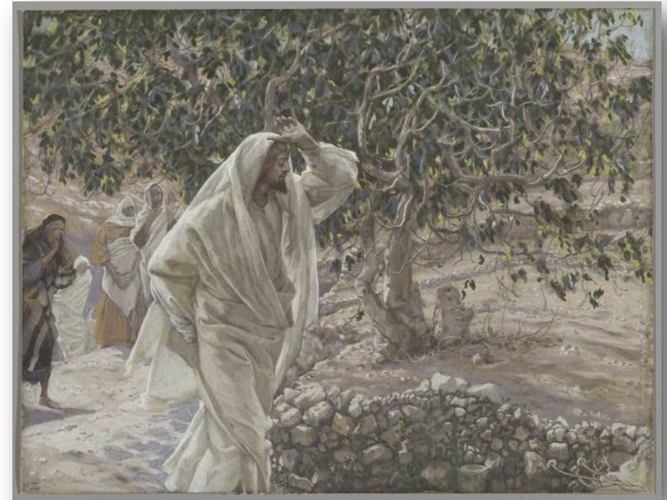
The Accursed Fig Tree by James Tissot

Services are available online through Facebook Live: Facebook.com/StJohnSouthampton