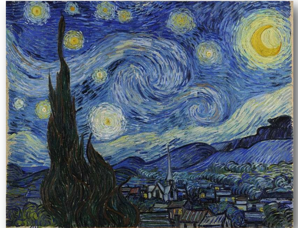
Starry Night Sky by Vincent Van Gogh

Services are available online through Facebook Live: Facebook.com/StJohnSouthampton