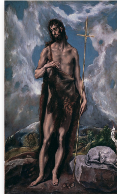
John the Baptist in the wilderness by El Greco

Services are available online through Facebook Live: Facebook.com/StJohnSouthampton