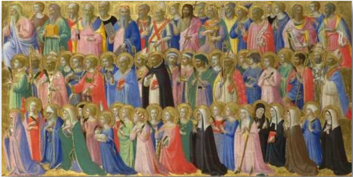
The Forerunners of Christ with Saints and Martyrs by Fra Angelico

We thank you for your generosity and willingness to spread God's love to our neighbors in need.