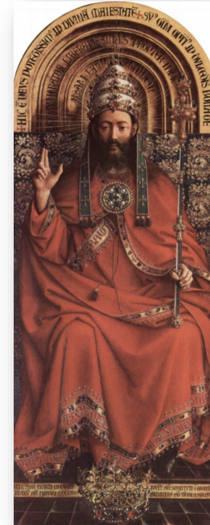
Detail from the Ghent Altarpiece , also called the Adoration of the Mystic Lamb by Hubert and Jan van Eyck

Services are available online through Facebook Live: Facebook.com/StJohnSouthampton