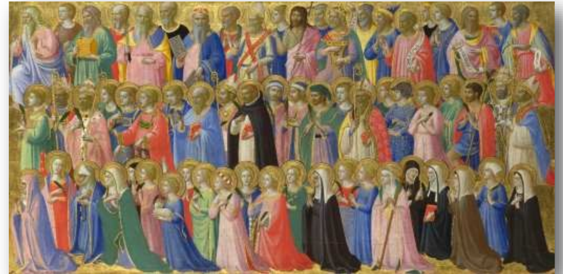
The Forerunners of Christ with Saints and Martyrs by Fra Angelico

St. John's Episcopal Church 100 South Main Street | P. O. Box 5068 Southampton, New York 11969-5068 (631) 283-0549