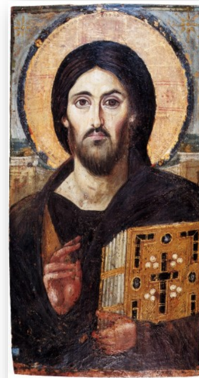
The Sinai Pantocrator

St. John's Episcopal Church 100 South Main Street | P. O. Box 5068 Southampton, New York 11969-5068 (631) 283-0549