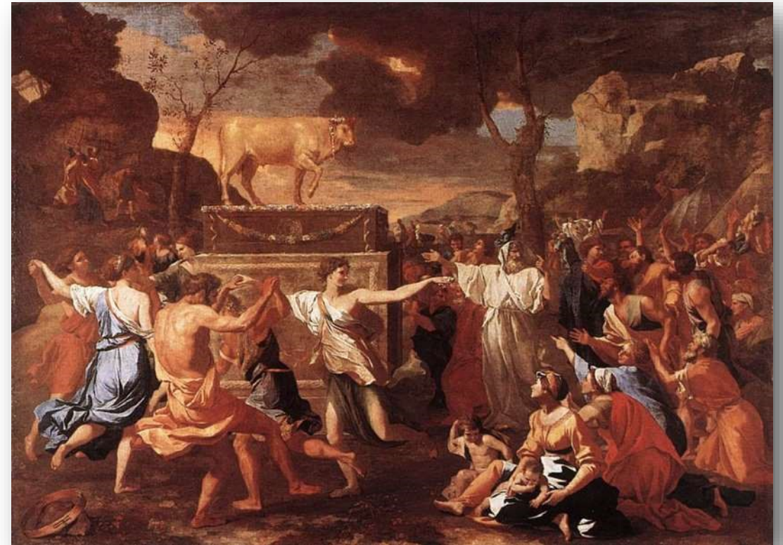
The Adoration of the Golden Calf by Nicolas Poussin

Services are available online through Facebook Live: Facebook.com/StJohnSouthampton