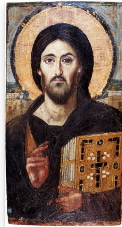
The Sinai Pantocrator

Services are available online through Facebook Live: Facebook.com/StJohnSouthampton