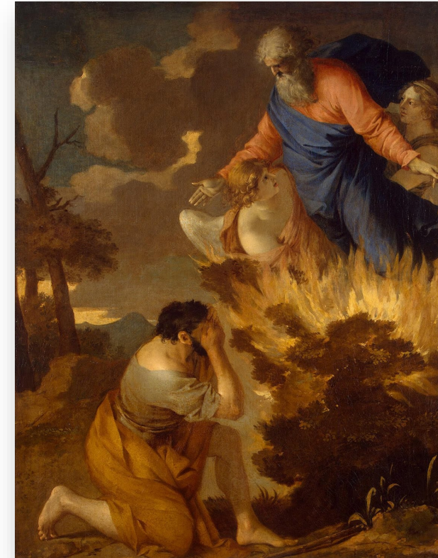
Burning Bush by Sébastien Bourdon

St. John's Episcopal Church 100 South Main Street | P. O. Box 5068 Southampton, New York 11969-5068 (631) 283-0549