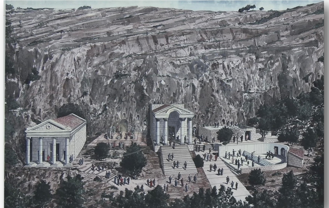
Artist rendering of the ancient temple complex at Caesarea Philippi rendered by the Israeli Ministry of Tourism

100 South Main Street | P. O. Box 5068 Southampton, New York 11969-5068 (631) 283-0549