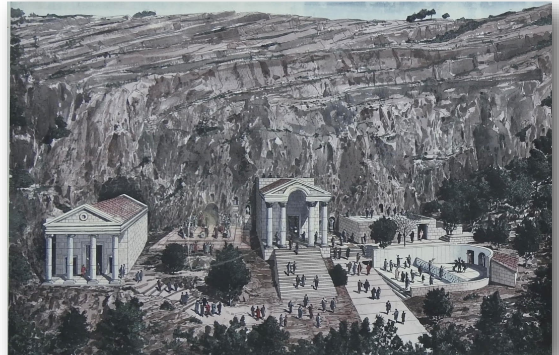
Artist rendering of the ancient temple complex at Caesarea Philippi rendered by the Israeli Ministry of Tourism

St. John's Episcopal Church 100 South Main Street | P. O. Box 5068 Southampton, New York 11969-5068 (631) 283-0549