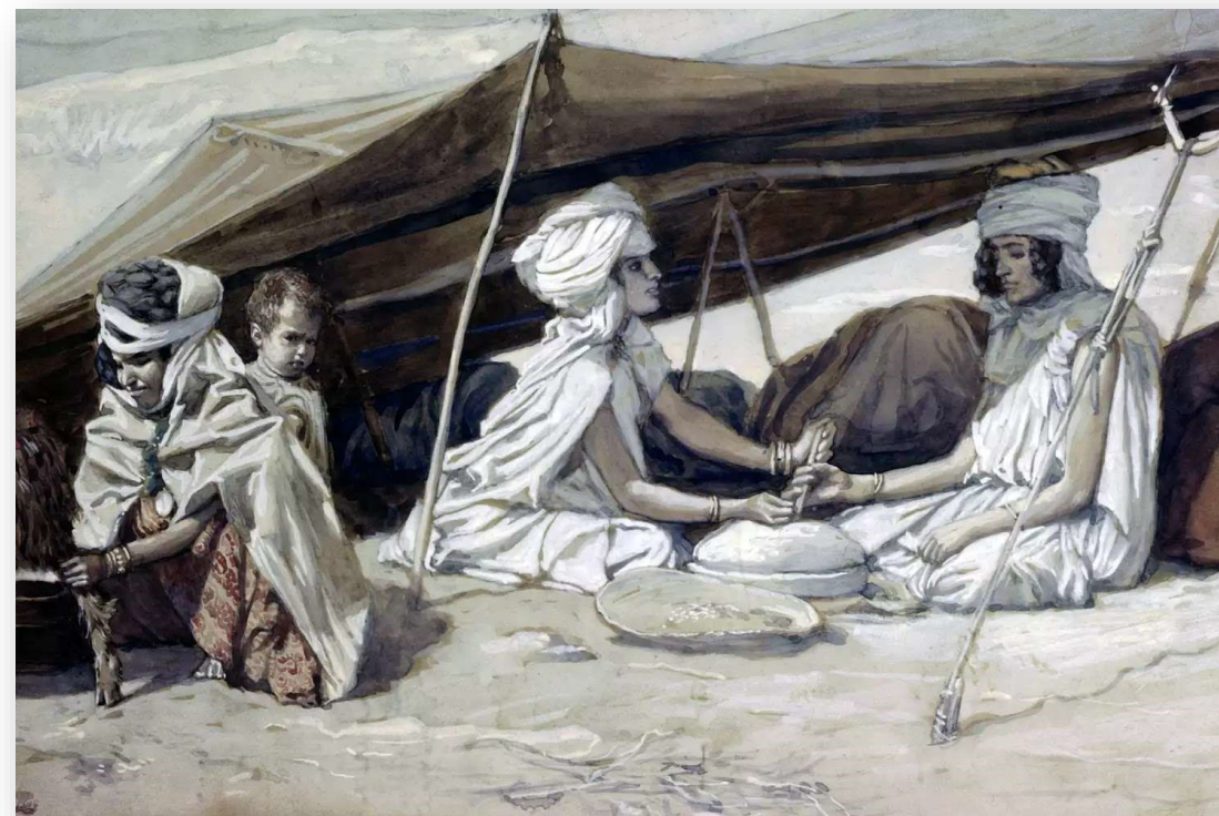
Rachel and Leah by James Tissot

St. John's Episcopal Church 100 South Main Street | P. O. Box 5068 Southampton, New York 11969-5068 (631) 283-0549