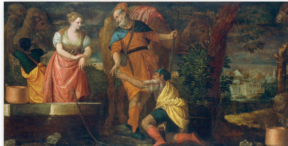
Rebecca at the Well by Veronese the Venetian

St. John's Episcopal Church 100 South Main Street | P. O. Box 5068 Southampton, New York 11969-5068 (631) 283-0549