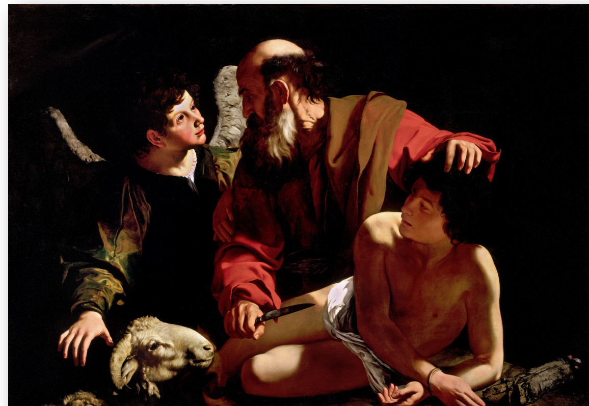
The Binding of Isaac by Caravaggio

St. John's Episcopal Church 100 South Main Street | P. O. Box 5068 Southampton, New York 11969-5068 (631) 283-0549