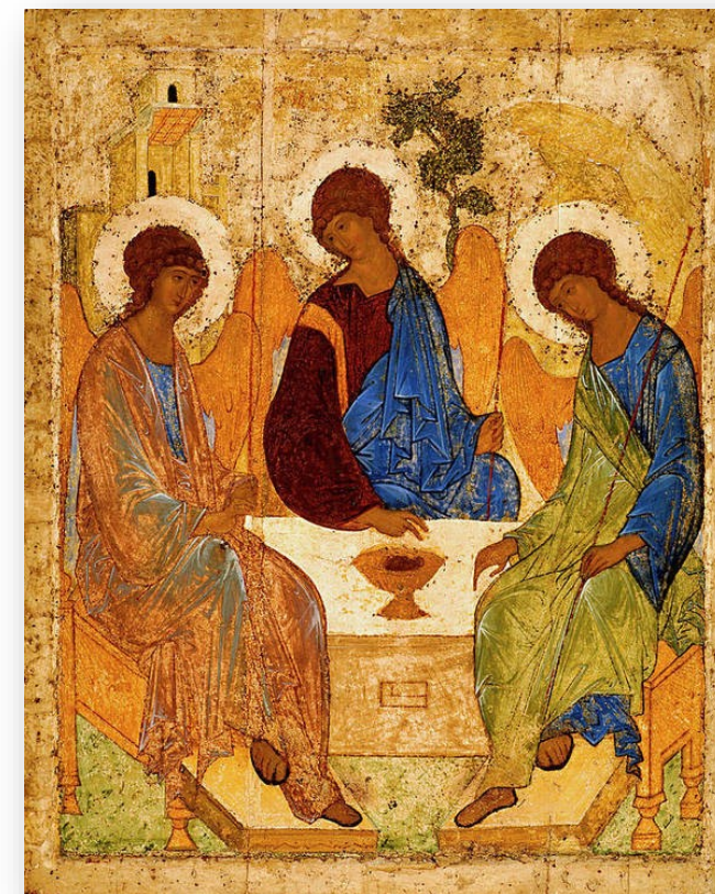
Rublev Icon by Andrei Rublev

St. John's Episcopal Church 100 South Main Street | P. O. Box 5068 Southampton, New York 11969-5068 (631) 283-0549