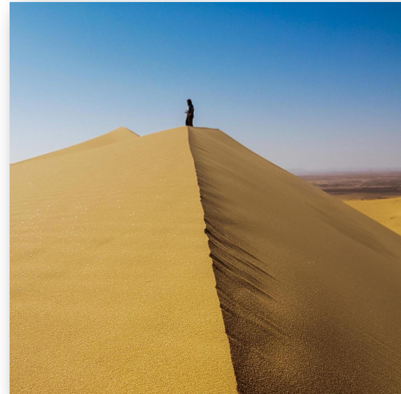
Nefud Desert

Services are available online through Facebook Live: Facebook.com/StJohnSouthampton