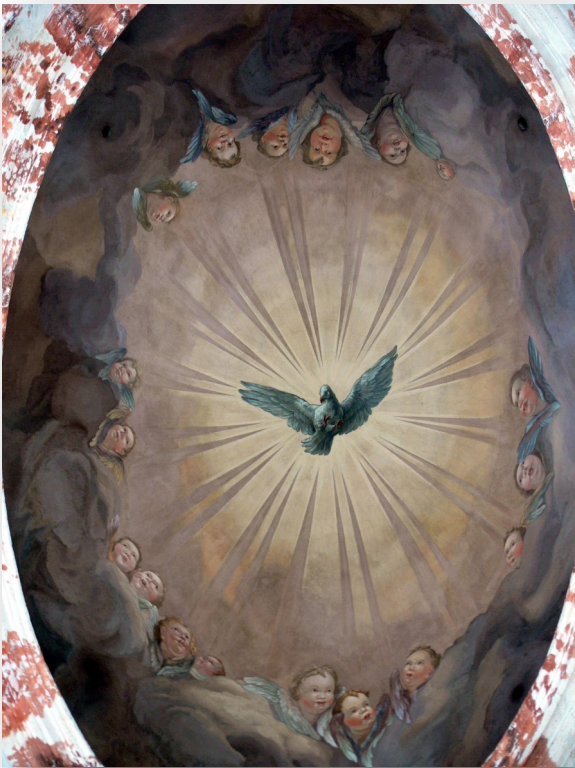
The Pentecostal Dove, a fresco in the Karlskirche in Vienna

Services are available online through Facebook Live: Facebook.com/StJohnSouthampton