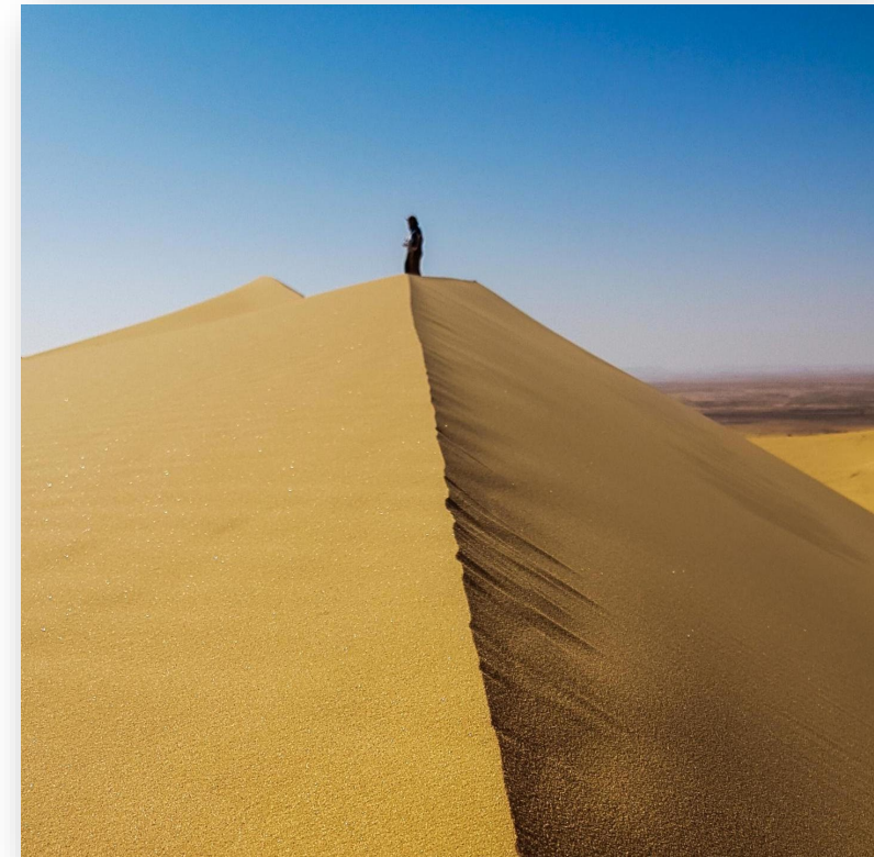
The Creation of Adam by Michelangelo in the Sistine Chapel, Vatican City

Services are available online through Facebook Live: Facebook.com/StJohnSouthampton